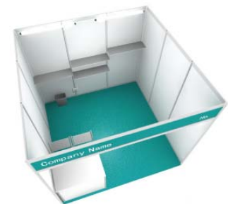
9sqm-Basic Standard Package