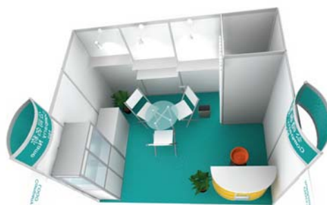
12sqm-Luxury Standard Package