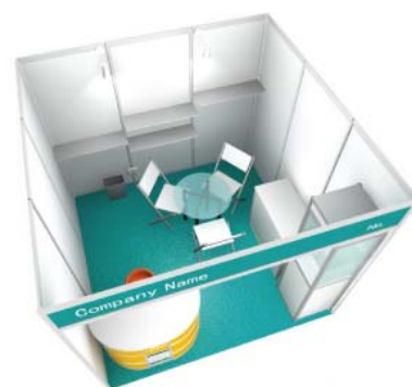
9sqm-Senior Standard Package

Our years of experience in organising trade fairs for the wine, olive oil, agriculture and fishery industries have enabled us to build a network of buyers, importers and distributors in the FMCG, airline, hotel, restaurant and food and beverage packaging trade sectors. This makes it possible for us to connect exhibitors and buyers quickly and effectively.